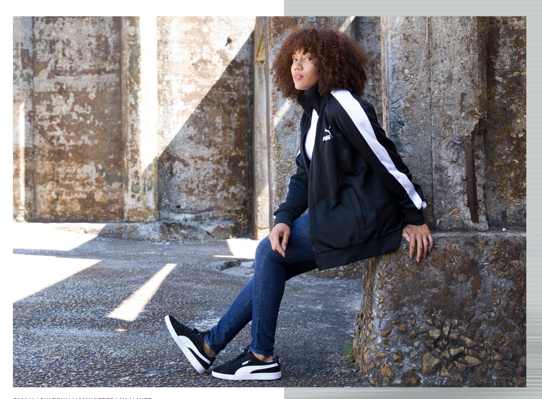
582364 ADULT PUMA ICONIC T7 TRACK JACKET