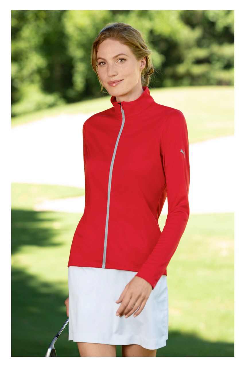
A596803 LADIES' ICON FULL-ZIP