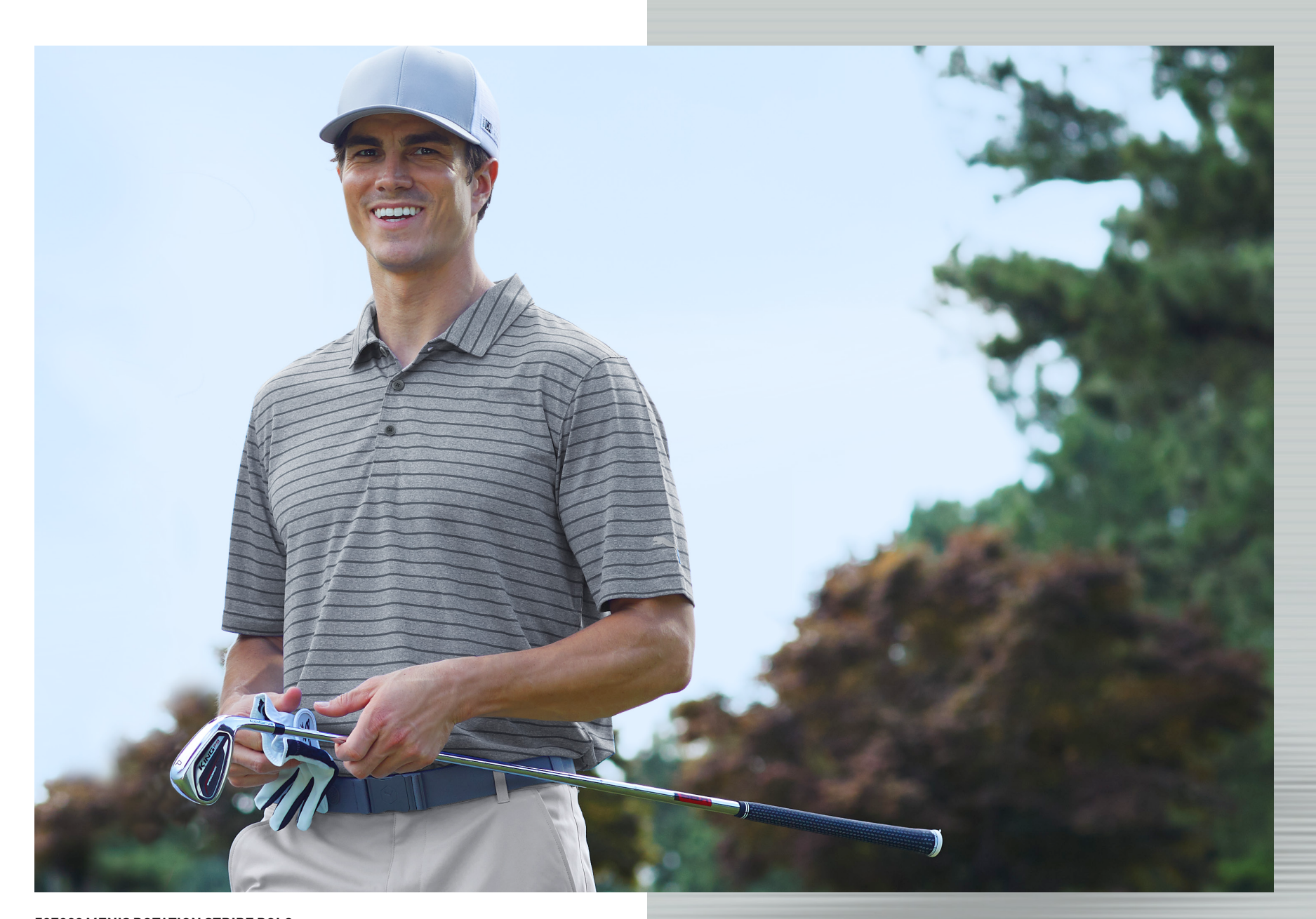
597223 MEN'S ROTATION STRIPE POLO