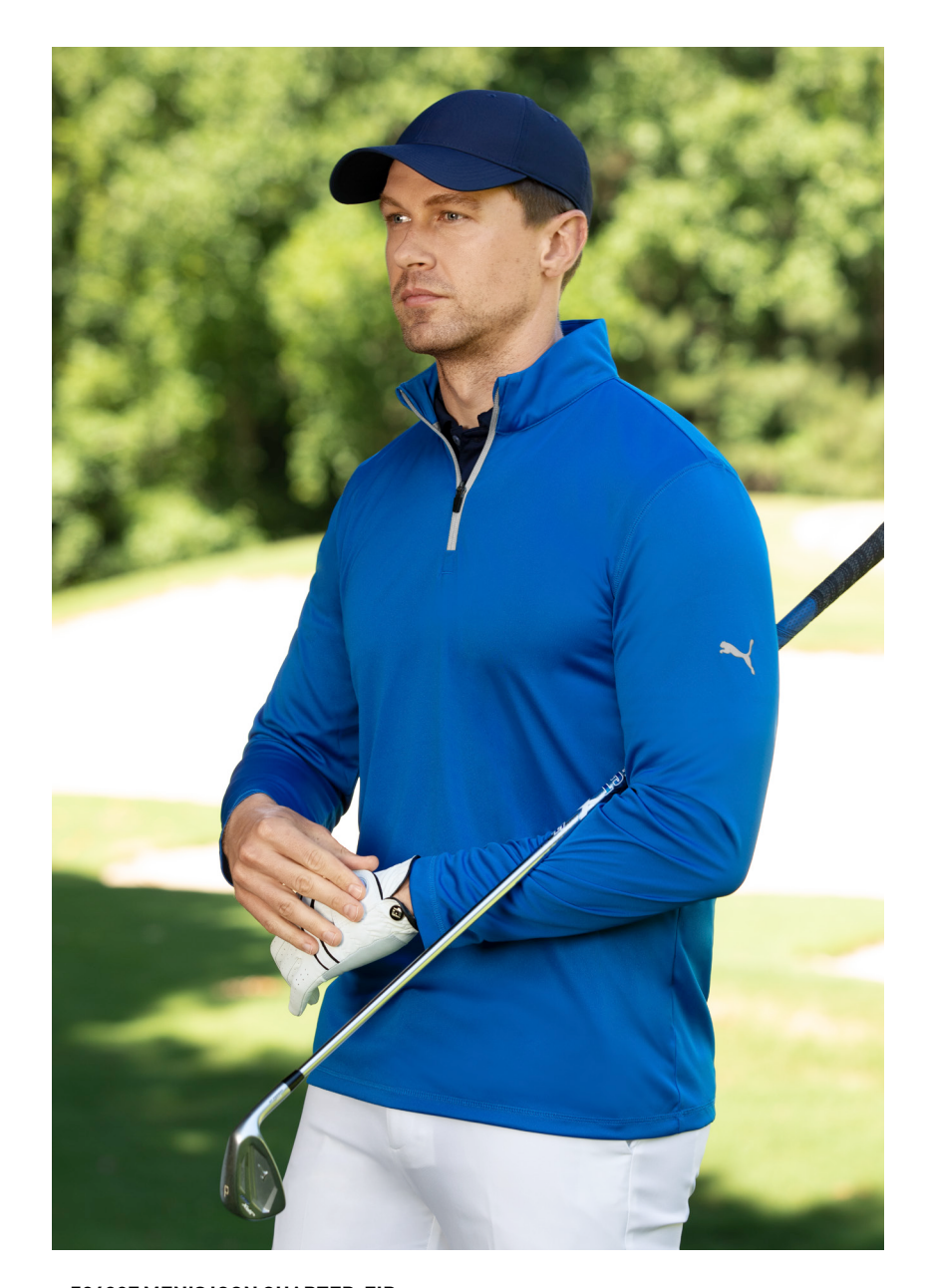
596807 MEN'S ICON QUARTER-ZIP