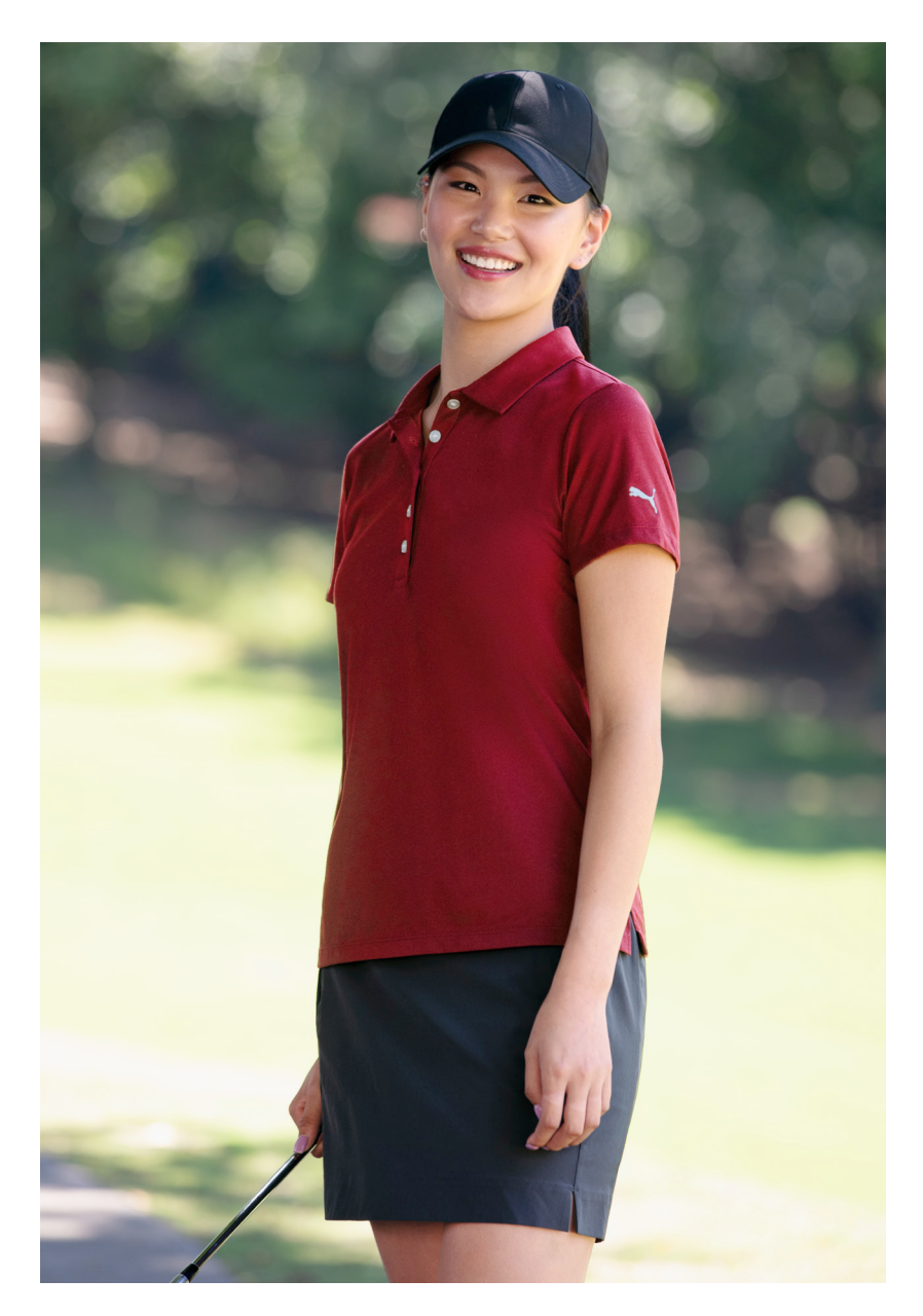
596921 LADIES' FUSION POLO