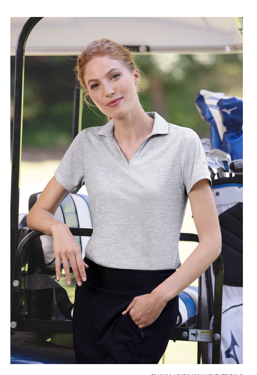
596802 LADIES' ICON HEATHER POLO